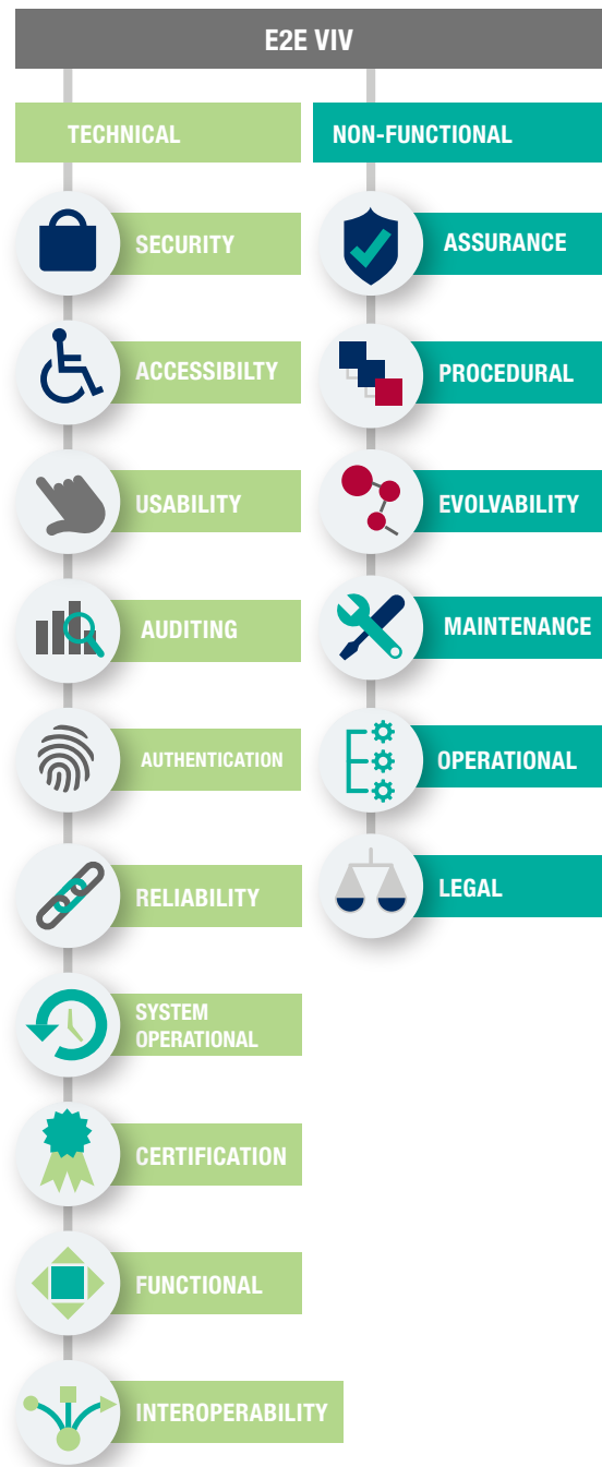
Figure 4.1: Requirements hierarchy for E2E-VIV systems.

Maintaining voter anonymity is critical. It must be impossible after the election to reconstruct a link between a cast ballot and any identifying information about the voter who cast it. However, in systems that